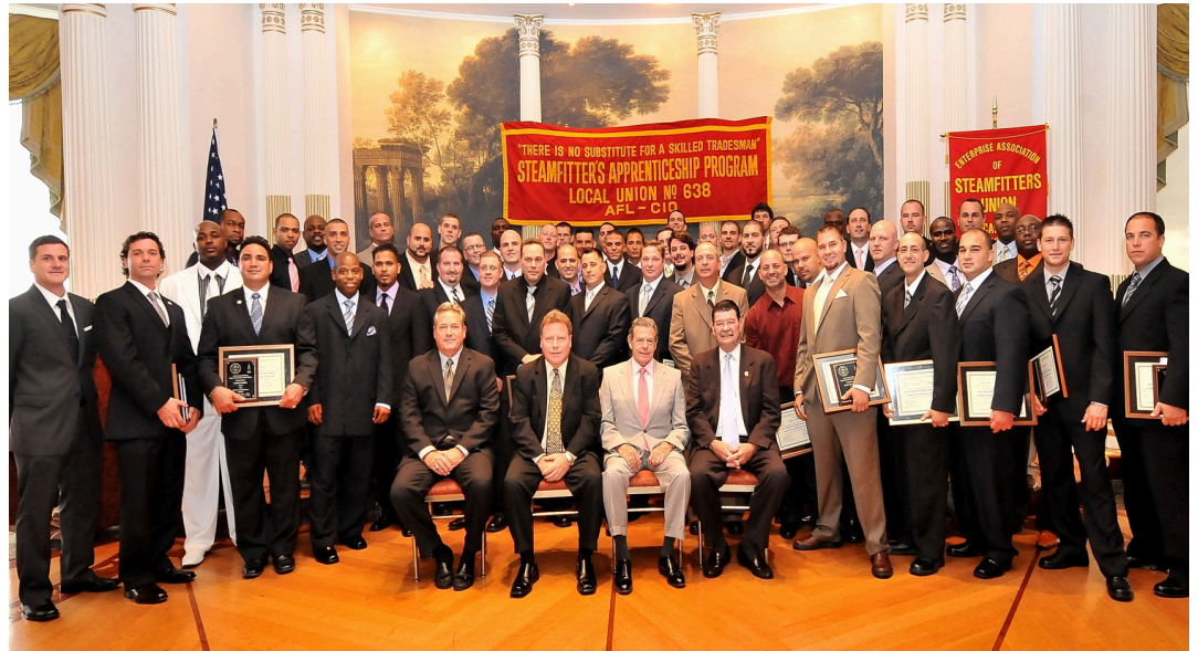
The 47 th group of graduating apprentices was honored at a Commencement Ceremony on June 17 th , 2010 at Terrace on the Park in Flushing Meadow Park, New York. Officials from Enterprise Association Local 638 and the Mechanical Contractors Association were on hand to congratulate the new graduates.