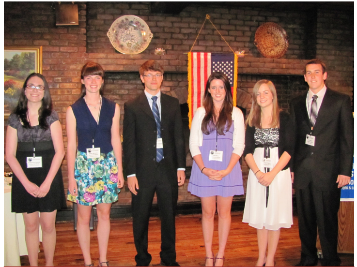
The 2010 Steamfitting Industry Scholarship Program Winners

Winning the Steamfitting Industry Scholarship Competition is proving to be something of a family tradition for many of our recipients. Three of our 2010 winners share this honor with older siblings, continuing an academic tradition their whole families can be proud of!